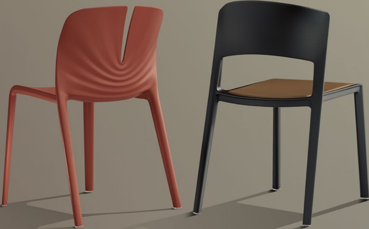
帛力丝 / 沃特丝