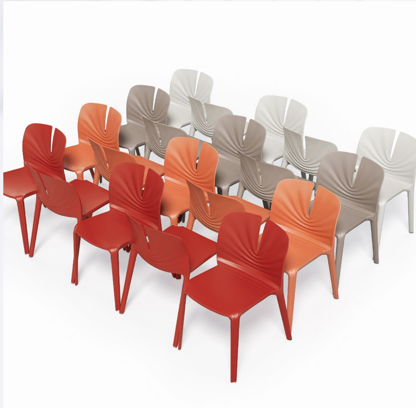
流光溢彩 Blooming light and color