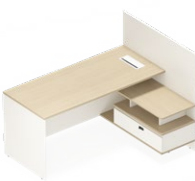
独立主管工位 Independent manager workstation