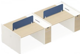
四人常规 (H750mm) 工位 Standard workstation (H750mm) for four people