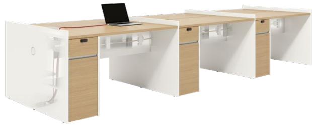
内部隐藏走线减少电源线的外露, 空间整洁美观 The concealed wiring design ensures a tidy workspace from top to bottom.

Even with a spacious desk, the area is limited. Utilize height to expand vertical storage, ensuring organized classification and storage of items. The three-tiered compartment inside the cabinet facilitates storage, while the top can be used for decorative items or plants, reducing clutter on the desktop.