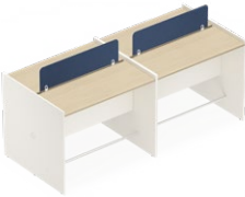
四人高坐姿 (H1150mm) 工位 Standing height workstation (H1150mm) for four people