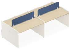
四人常规 (H750mm) 工位 Standard workstation (H750mm) for four people