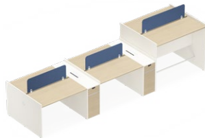
四人常规 (H750mm) 工位+高桌洽谈区域 Standard workstation (H750mm) for four + negotiation area