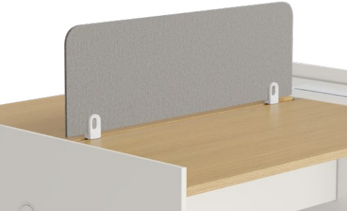
扪布薄屏 Upholstered screen

多变的屏风选材，满足灵活的现代办公空间搭配需求。 Versatile screens meet various space matching requirements of modern offices.