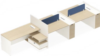
独立主管工位+常规职员工位 Independent manager workstation + standard staff workstation