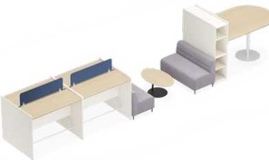
四人高坐姿 (H1150mm) 工位+休闲洽谈区域 Standing height workstation (H1150mm) for four people + lounge area