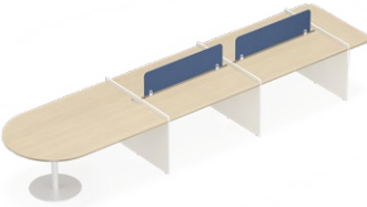
四人常规 (H750mm) 工位+协同区域 Standard workstation (H750mm) for four people + collaboration area