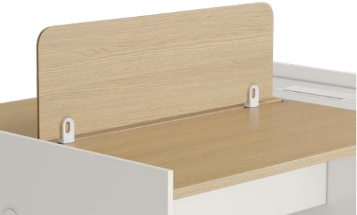
板式薄屏 Melamine screen

屏风吸取了阿尔卑斯山脉的线条，融合草间弥生的波点艺术，让挡板也是空间的一件艺术品，工作仿佛置身于山林里；搭配皮筋可作为收纳展示区。